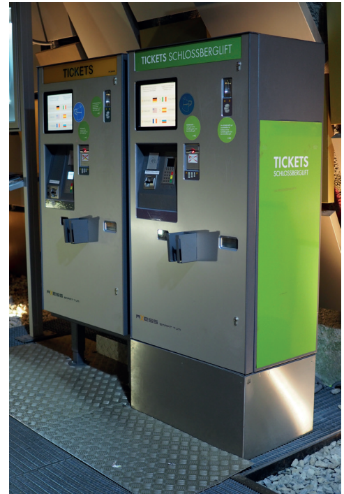
Ticket vending machines