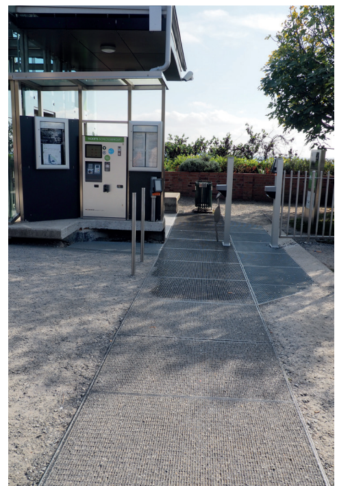
Lift access at Schlossberg