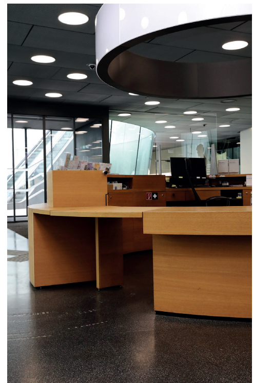
Information, checkout area