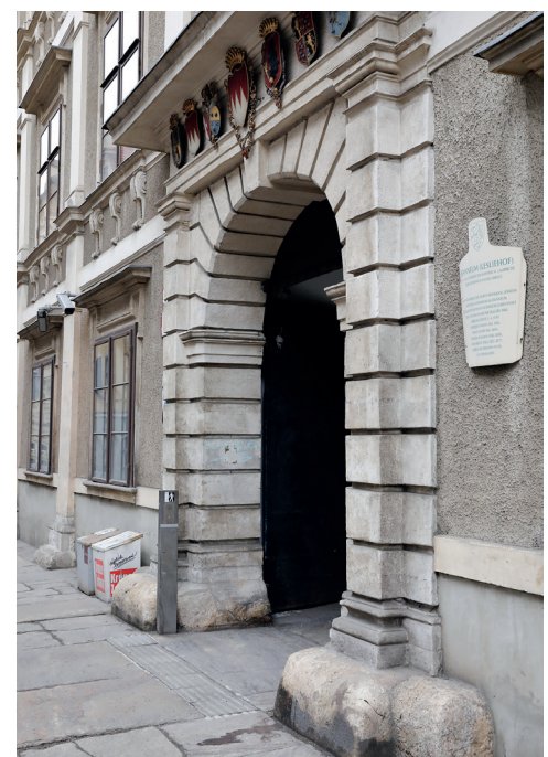
Access from Raubergasse with information stele for blind people