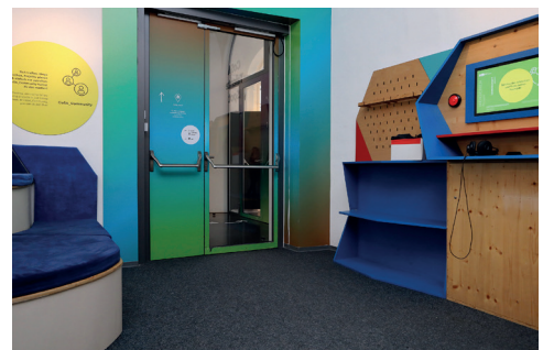
doors to exhibition area