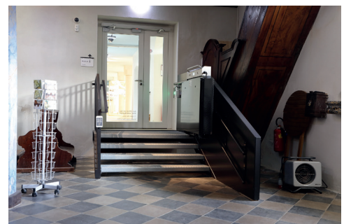
Stair lift to St. Anthony’s Church