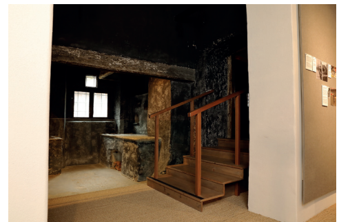
Historic „smoke kitchen“