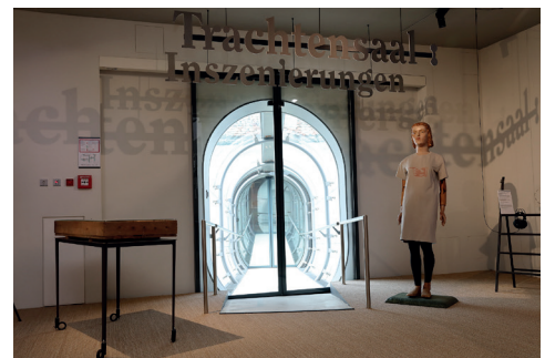
Ramp to „Trachtensaal“