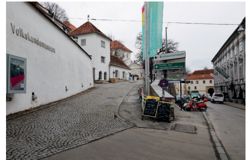
Path from Paulustorgasse