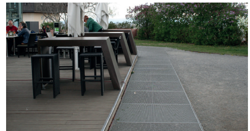
Access to/from lift

Please use the route planner of the Styria Public Transport Network (Verbundlinie Steiermark): https://verkehrsauskunft.verbundlinie.at/