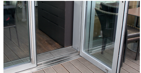
Access to terrace