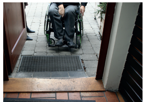
Access from the outdoor dining area