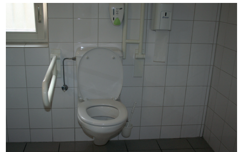
WC and WC layout plan