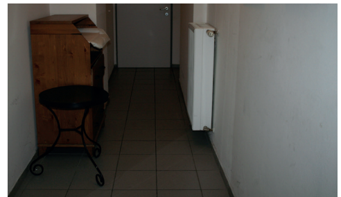
Corridor to WC