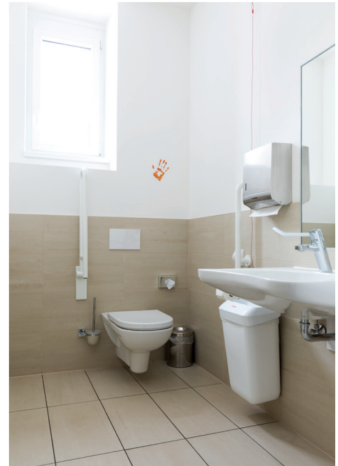
General barrier-free WC

Graz Tourismus und Stadtmarketing GmbH Messeplatz 1/Messeturm 8010 Graz | Austria T +43 316 8075 0 www.graztourismus.at