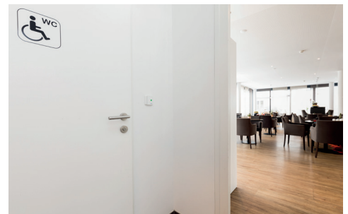
General barrier-free WC