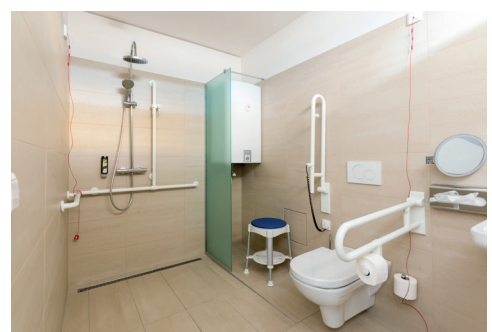
Bathroom: Suite 002