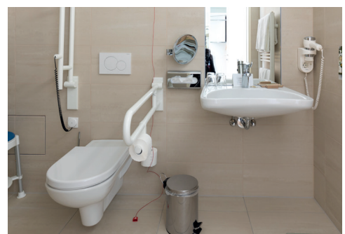
Bathroom: Suite 002